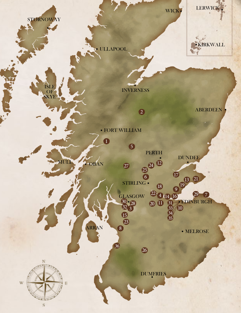
Image 3, 4, 5, 10 and 17 © 2014, 2015 Sony Pictures Television Inc. All Rights Reserved. Image 19 and 24 © 2016 Sony Pictures Television Inc. All Rights Reserved. Image 34 © 2017 Sony Pictures Television Inc. All Rights Reserved.