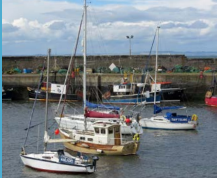
1. Cockenzie / Port Seton

The essential guide to film and television locations in East Lothian