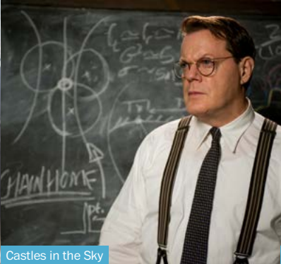
Castles in the Sky