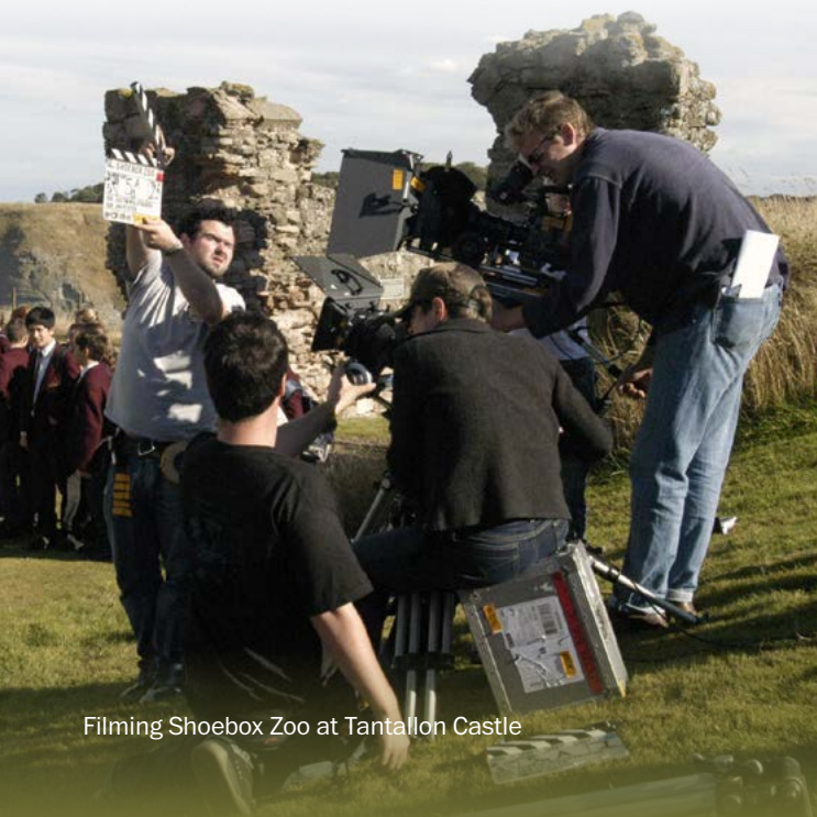
Filming Shoebox Zoo at Tantallon Castle

East Lothian is only 30 minutes drive from Edinburgh Airport and situated on the main A1 route, as well as having easy access from the A68 and M8. Regular buses link towns and villages. Musselburgh, Wallyford, Prestonpans, Longniddry, North Berwick, Drem and Dunbar have rail stations.