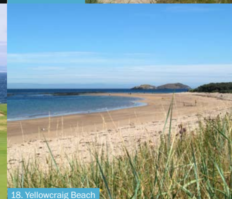
18. Yellowcraig Beach