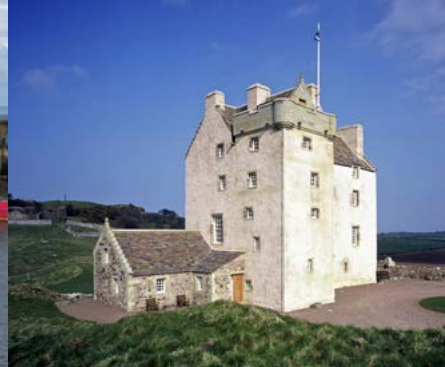
2. Fenton Tower