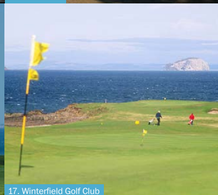
17. Winterfield Golf Club