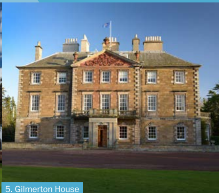
5. Gilmerton House