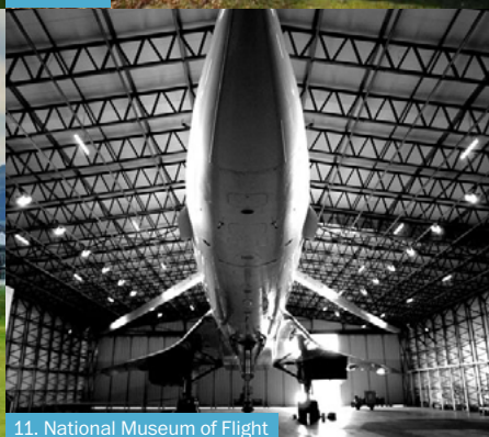
11. National Museum of Flight