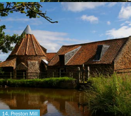
14. Preston Mill