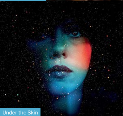
Under the Skin