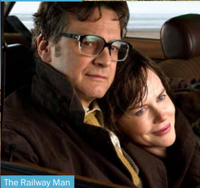
The Railway Man