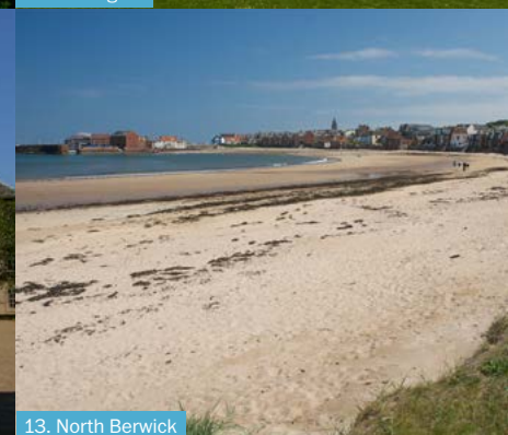
13. North Berwick