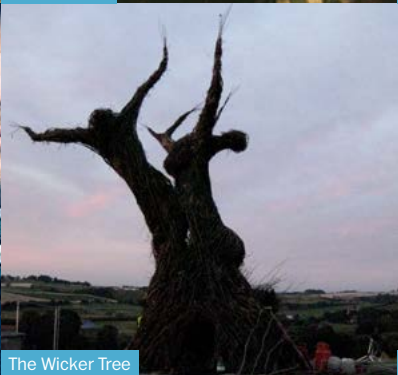
The Wicker Tree