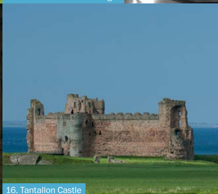
16. Tantallon Castle