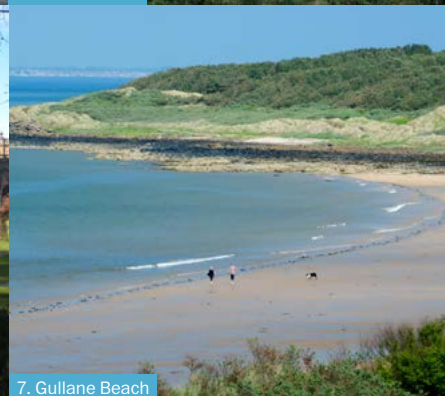
7. Gullane Beach