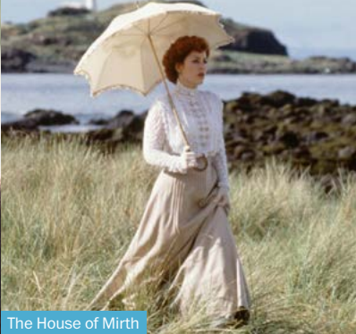
The House of Mirth