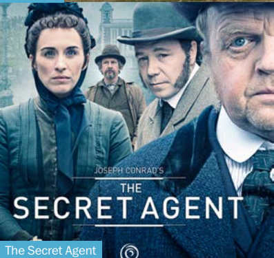
The Secret Agent