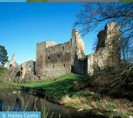
9. Hailes Castle